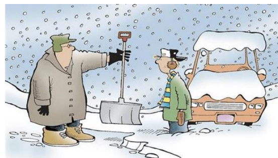
SORRY, SON... THERE'S NO APP FOR THAT